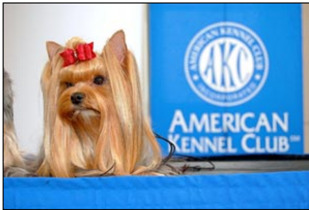
A Yorkshire Terrier shows off her shiny coat.