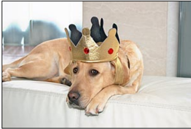
The Labrador Retriever finds all this attention rather tiresome!

AKC Homepage | About this Site | Employment | Answer Center | Corporate Advertising | Privacy Statement | Terms of Use | Your CA Privacy Rights