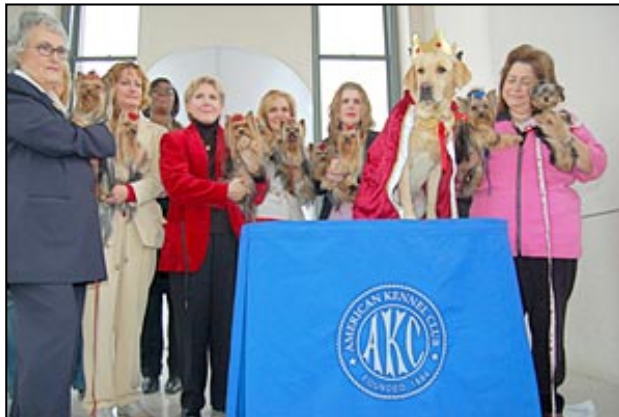
Proud Yorkie owners surround the Labrador Retriever as she regally models her crown and cape.