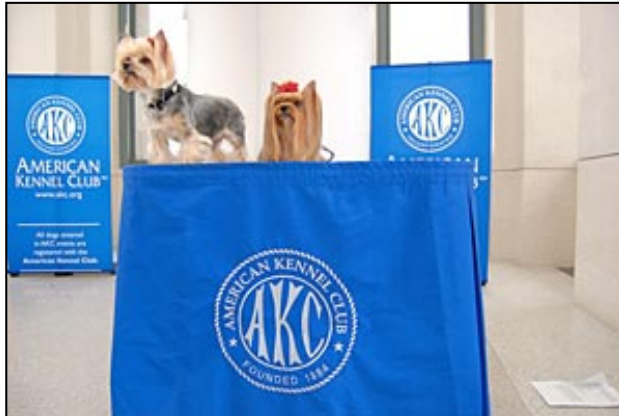
Two Yorkshire Terriers celebrate their moment in the spotlight.