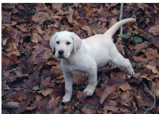
"Hooch" a new kid on the block

In an effort to diversify selection here at Alderwood, we have added "Hooch". He is a yellow Lab but so light in color he could be referred to as white. Just a little touch of gold on the ears and some on his back. As he grows there may be more yellow appear, but we are hoping that he stays real light. Hooch won't be ready to breed for another year but he is taking lessons from Doc. It is amazing how those two get along with each other, Hooch follows Doc everywhere, worries him to death! It is amazing to watch a pup's personality develop. You can see the pictures of Wiley and Gretchen at the top of this newsletter. We kept them to perpetuate Amber's bloodline. She is four years old now and we will only get a few more litters from her before she is retired to the front porch. Amber is one of the most even tempered, best disposition Labs we have ever met. It appears that she has passed these traits along to our pups. We hope that Gretchen and Wiley will pick up where their Mama left off. The combination of Doc's personality with Amber's is going to make some outstanding Labs, not to mention the confirmation features of both... we're excited!